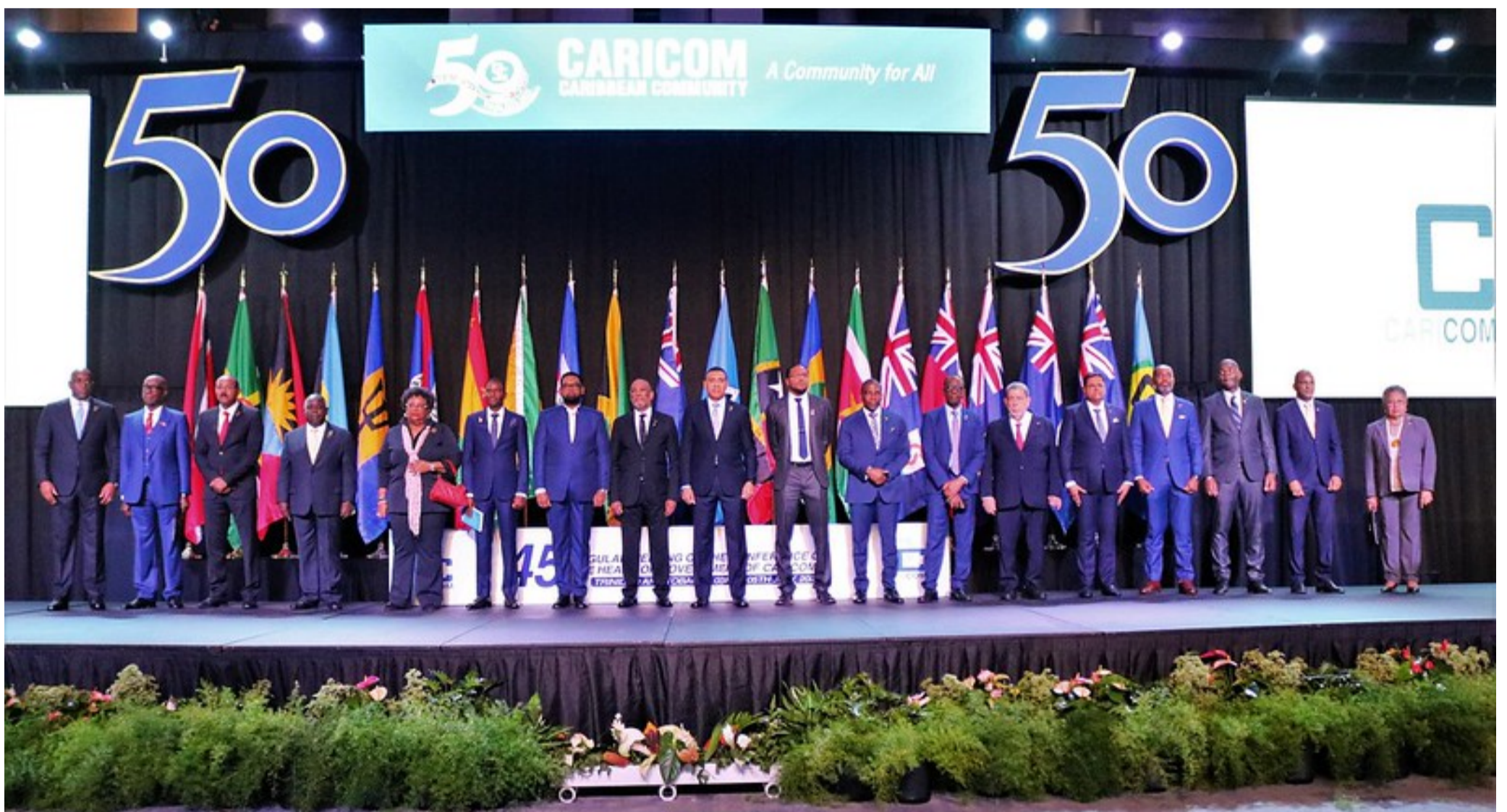
Heads of Government at the Opening Ceremony of the 45th Regular Meeting of the Conference of Heads of Government

The Forty-fifth Regular Meeting of the Conference of Heads of Government of the Caribbean Community (CARICOM) was held from 3- 5 July 2023. In acknowledgement of the 50 th Anniversary of the signing of the Treaty of Chaguaramas in 1973, it was agreed that Trinidad and Tobago would host.